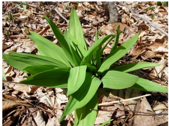
Ramps on the forest garden site.

The forest garden site is likely to be a very successful location for cultivation of ramps, which naturally grow in rich, moist soils beneath a canopy of beech, birch, and sugar maple. Ramps