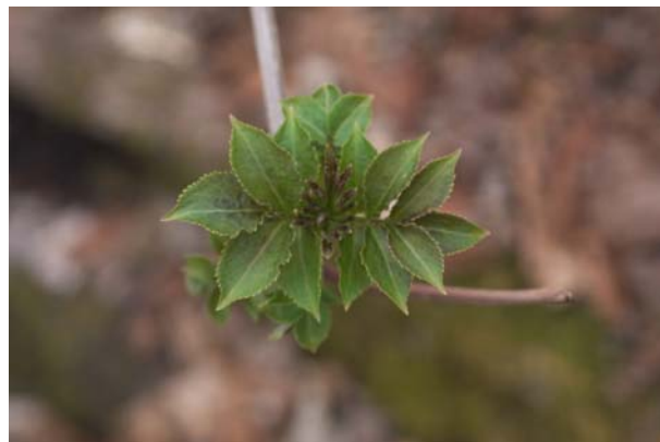
Young elderberry leaves.

Elderberry generally grows in fertile, moist soils, but is a hardy and adaptable species that will tolerate a variety of conditions when cultivated. Considered partially self-fruitful, elderberry does best when planted near at least one other cultivar. Young elderberry plants can be