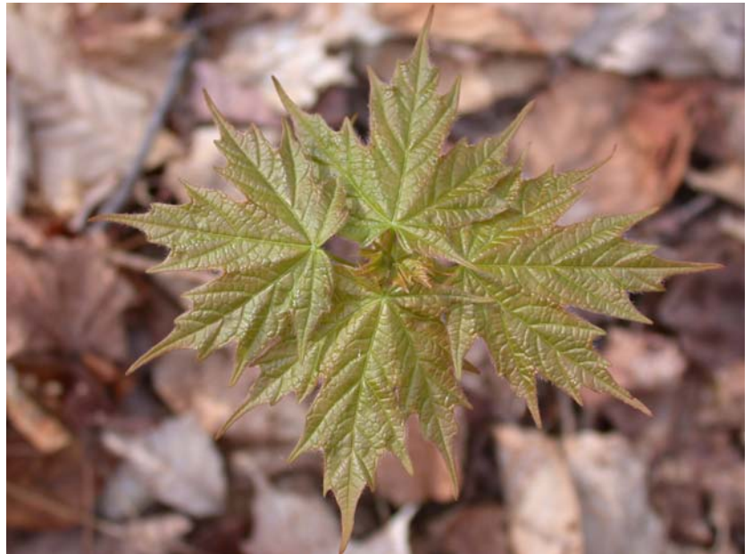
Sugar maple seedling.

A native species already present on the site, sugar maple is a late-successional tree of northern hardwood forests, tending to be dominant on richer sites. This species is shade-tolerant, so it can regenerate under a closed canopy. Several large and medium-sized sugar maples are present in the forest garden site; however, sugar maple is not actively regenerating. Over the last couple of years the stand has been thinned to encourage regeneration, with few signs of positive results. As the forest garden is developed, attention should be paid to sugar maple seedlings; they should not be disturbed. Beech saplings, on the other hand, are shooting up all over the site. These should be regularly trimmed back.