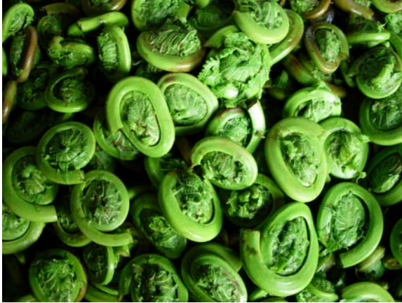
Ostrich fern fiddleheads ready to be cooked.

Ostrich fern already occurs on the forest garden site in small numbers. This site is probably only marginally suitable for ostrich fern, since this species spreads aggressively and takes over the herbaceous layer on sites where it thrives. With some assistance, it may become more successfully established on this site.